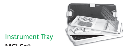
Instrument Tray MCLS28